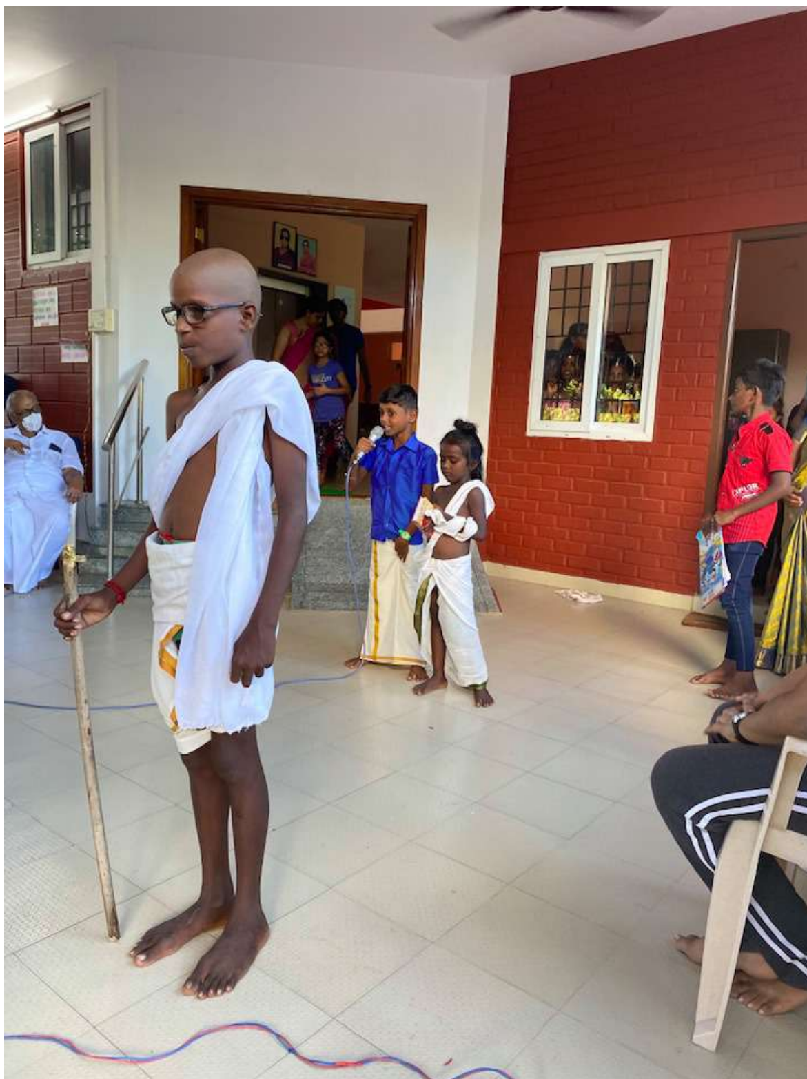
Children performing on Gandhi Jayanthi day at Anbagam